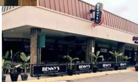
Benny's Bar & Grill in Potomac (2013)