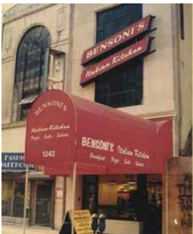
Benson's Italian Kitchen (1996)