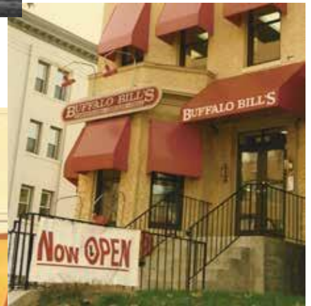
Buffalo Bill's (1988)