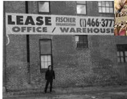
The Fischer Organization Real Estate Co., a boutique commercial real estate brokerage (1993)