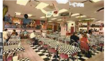
Cafe 57 (1986)