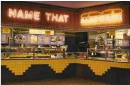
Name That Sandwich, Montgomery Mall (1987)